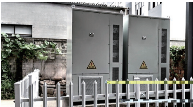
Figure 1: Project Photos